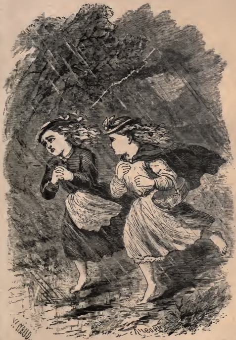
A SAD FRIGHT. Page 80.